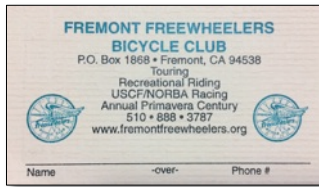
Vintage Membership Card

Go online to - www.ffbc.org - click on to the membership page, log in and then renew your membership. The price is still the same: $20 for an individual membership, $26 for a family membership.