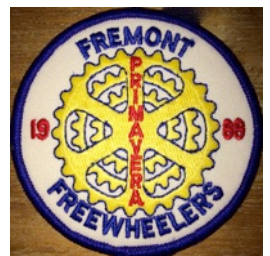
Vintage Patch from Bert Silver