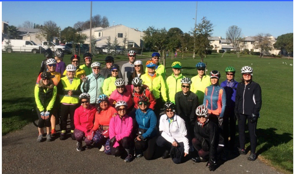
January 22: First Conditioning Ride!

When riding remember: "It's not the pace, it's the smiling face." Julie Ganzlin