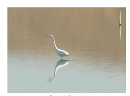
Great Egret Yellow bill, black legs