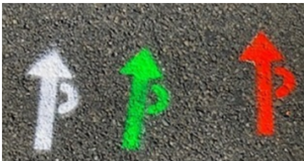
Fun Ride 100 km 100 Mile (85 mile)