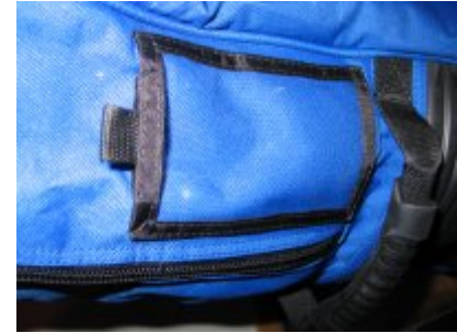
Rubberized dowel handle for easy pulling and I.D. pocket