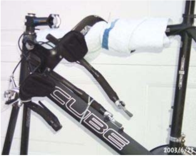
Detail of packing for carbon aero handle bars on Tri-bike