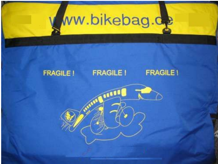
Fragile ! - Clear labeling ensures careful handling and is important for insurance claims. Removable shoulder strap.