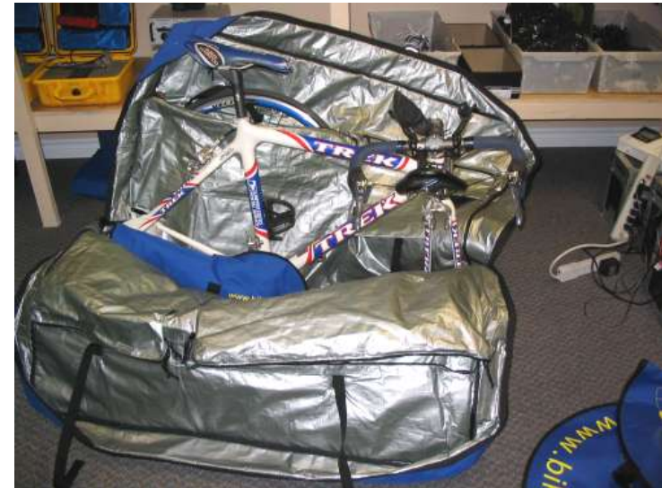
fully padded bikebag for road-bike.....and Mountain bike