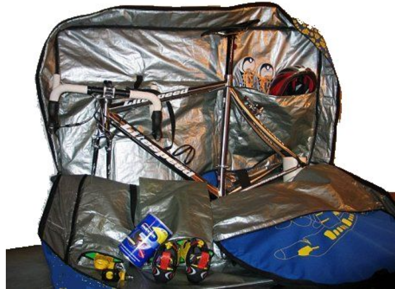
Multiple internal pockets provide space for helmet, shoes, tools, wetsuit etc.