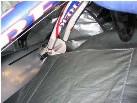
Front mount can be turned 90 degrees to fit a variety of forks and handlebar combinations